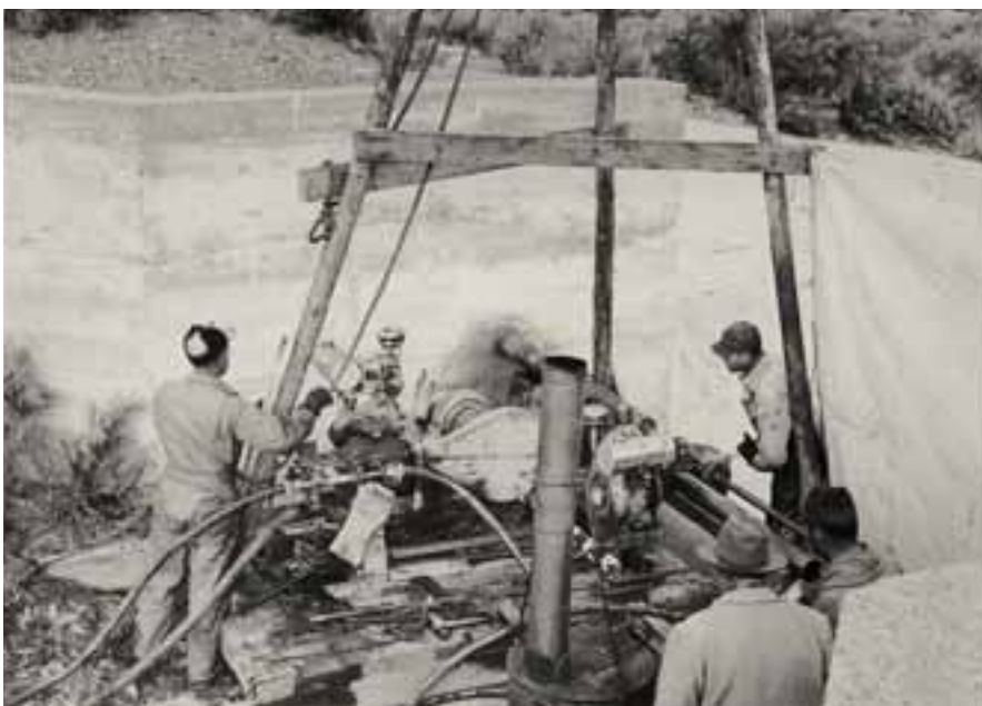
Drill rig crew takes core sample from spillway on an old irrigation canal.