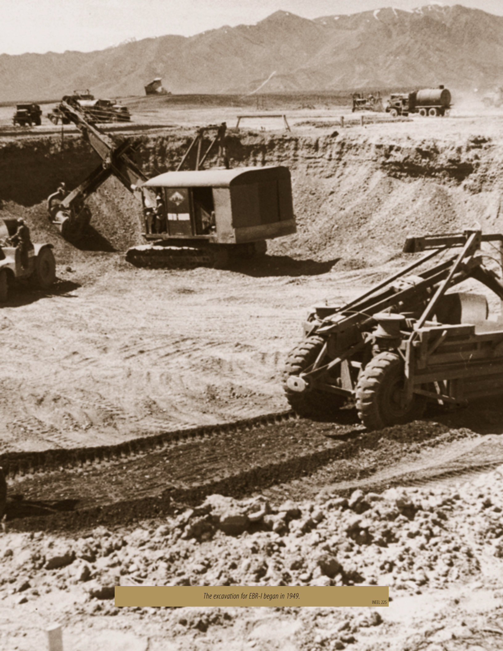
The excavation for EBR-I began in 1949.