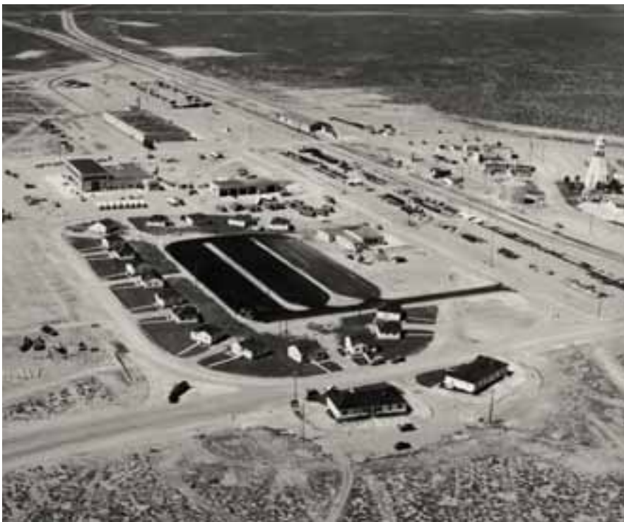
Residential area of the Naval Proving Ground as it looked in July 1951, view to southwest. Older section is at right near water tower.

The concussion wall, designed to absorb blast and protect those who fired the guns, was a particularly formidable piece of architecture. Standing between the gun emplacements and the residential area to the south, it was 315 feet long, 8 feet thick, and 15 1/2 feet high. Its rebar was doubled and placed in a close eight-inch grid. Those in the control tower behind the wall could peer out of narrow window slits at the emplacements, each painted with a letter to make up the slogan “SAFETY FIRST.” 6