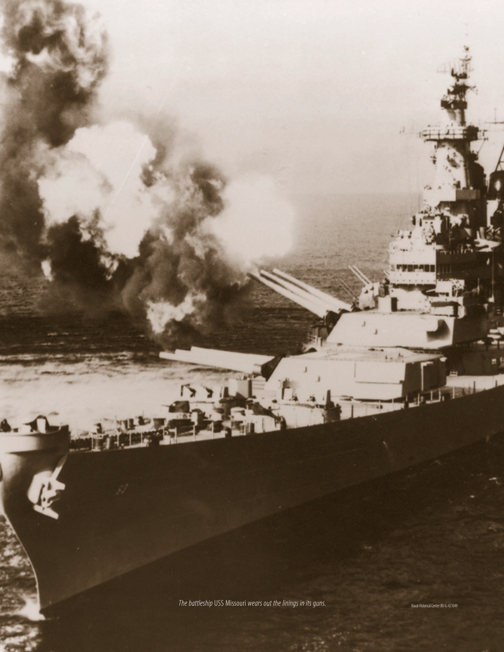
The battleship USS Missouri wears out the linings in its guns.