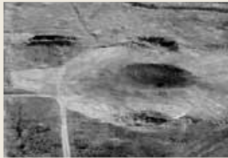
U.S. Army Corps of Engineers, Rock Island District

The huge cloud of dust seemed to hover over the spot for about ten minutes and gradually moved westward toward the Arco community, as the air currents destroyed the symmetry of the cloud and it began to resemble a huge dust storm.