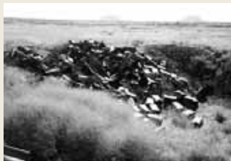
U.S. Army Corps of Engineers, Rock Island District

An inspection of the spot where the igloo stood showed a pit approximately 15 feet deep which was strewn with large chunks of reinforced concrete, steel and wire reinforcing material. Most of the steel surrounding the bombs of TNT seemed to have been completely destroyed, although small fragments were found a half mile distant.