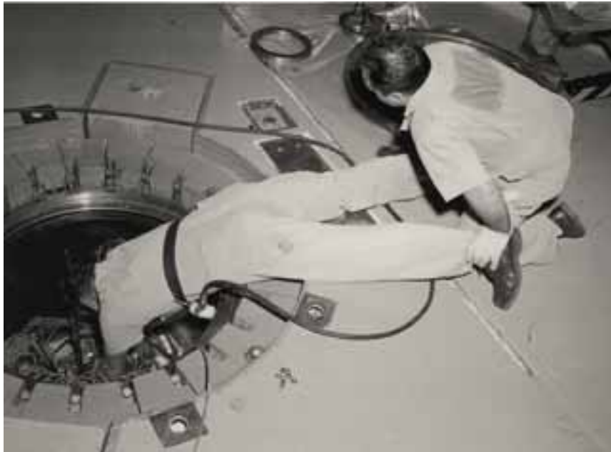
Teamwork inside the NRTS duplicated the outside teamwork among NRTS supporters. Here, technicians work over the core of EBR-I.