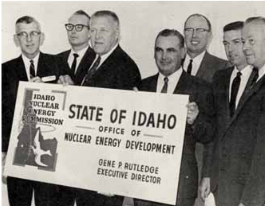
1967 INEC Annual Report