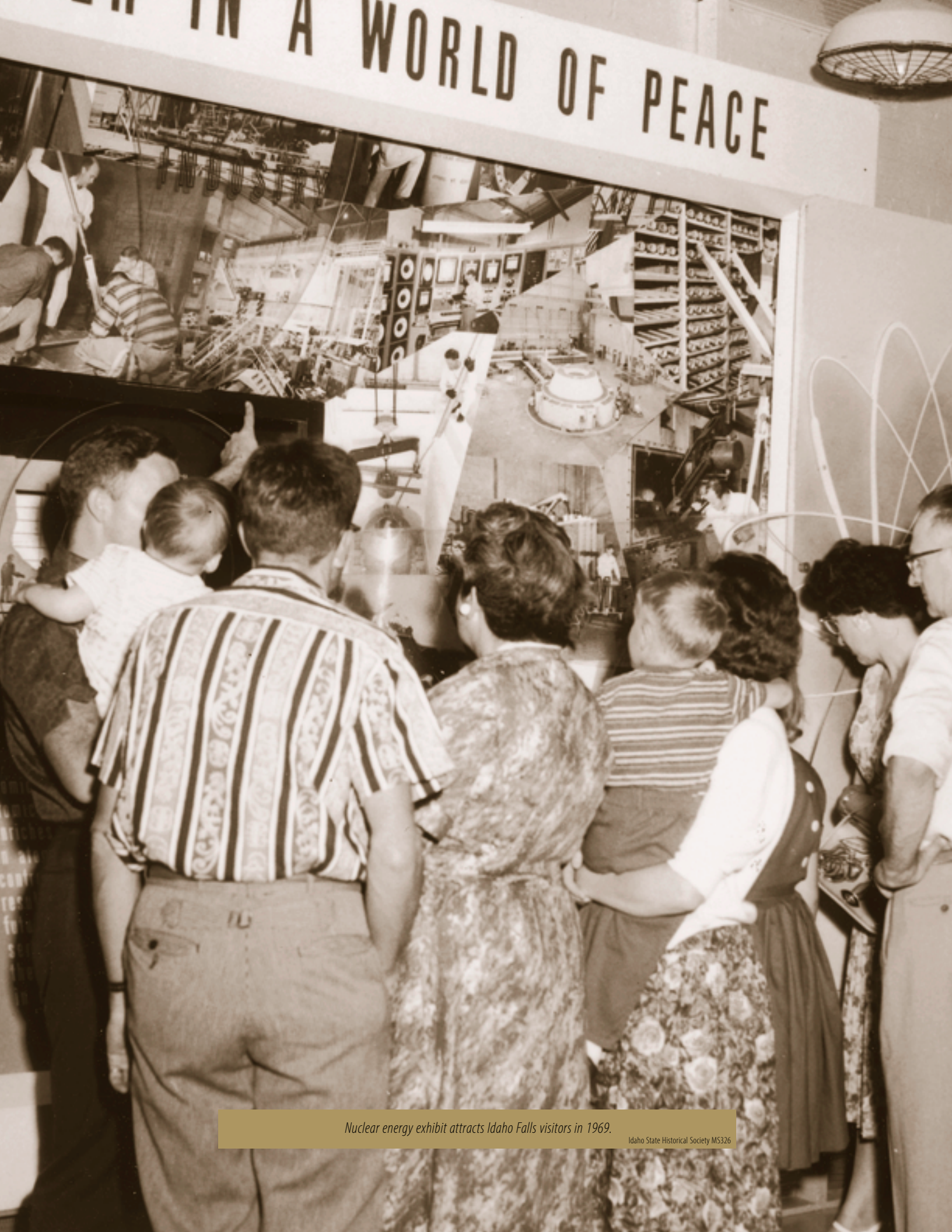
Nuclear energy exhibit attracts Idaho Falls visitors in 1969.