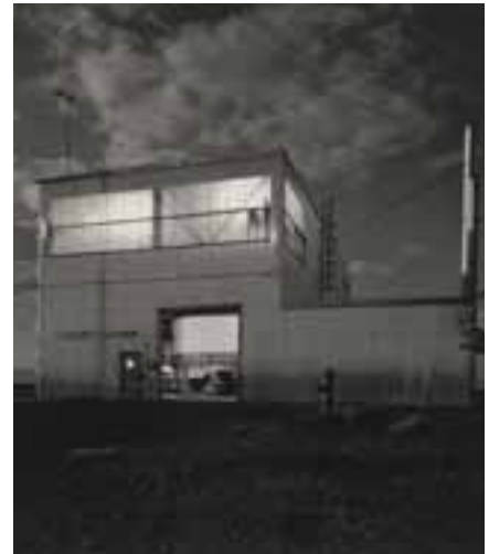
Argonne National Laboratory-West 7330

The technical issue appeared to be the type of fuel planned for each reactor. Argonne's efforts with EBR-II fuel to date had been to improve uranium-