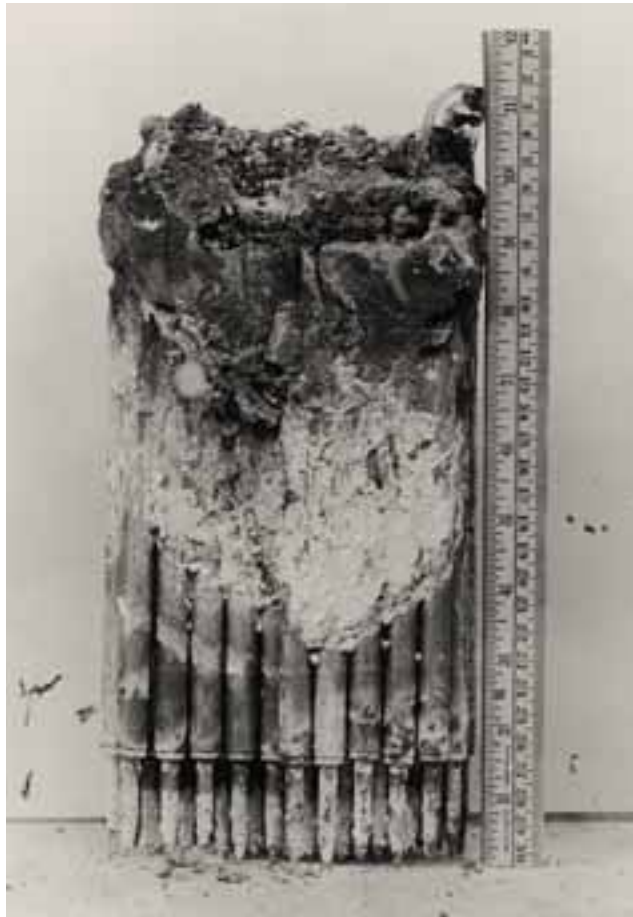
Argonne National Laboratory-East 103-237

a plant for recycling the spent fuel and recovering the plutonium economically. Experimental Breeder Reactor-II (EBR-II) would be a compact industrial plant: generating electricity and recycling its own fuel. The idea was still in the realm of experimentation. To consummate the vision, the project would have to solve one problem after another, safety and otherwise. Zinn and the AEC—and Detroit Edison—felt the problems were well worth solving.