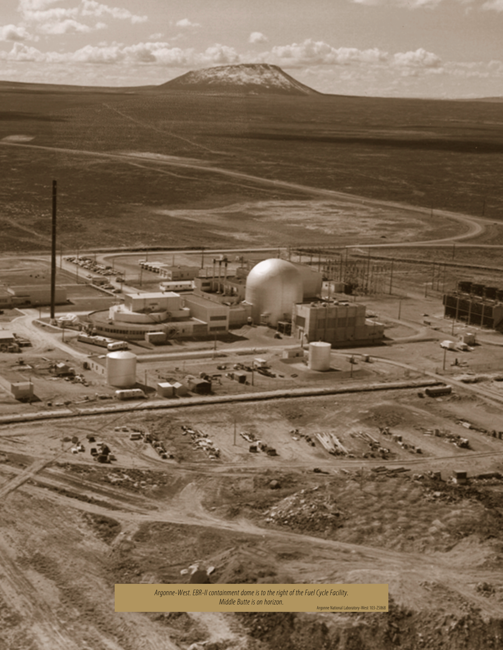
Argonne-West. EBR-II containment dome is to the right of the Fuel Cycle Facility. Middle Butte is on horizon.