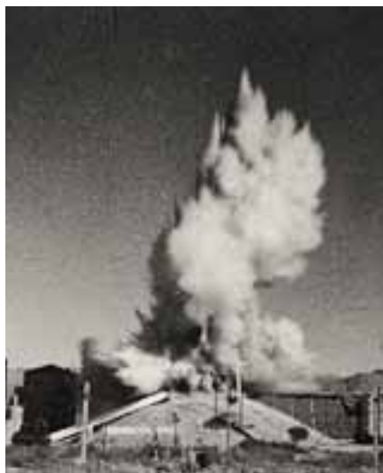
Argonne National Laboratory-West 201-709

accessories to be working well, but something within the core of the reactor—a badly-made fuel element, perhaps, or impurities in the coolant—can affect the rate at which the uranium atoms are fissioning. Instead of splitting at a certain rate per second, the atoms split at twice that rate, or four times. If unchecked, such an "excursion" could overwhelm the heat-removing apparatus, melt the fuel, inspire chemical explosions, and cause a release of fission products into the environment.