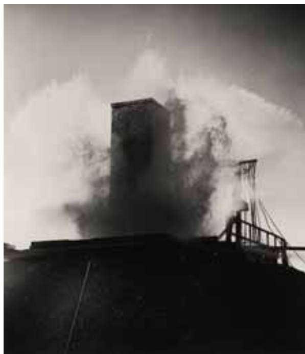
Argonne National Laboratory-West 103-42

reactor, he would pull the control rod out of the reactor core, for example, and the water would bubble and hiss, spit scalding water 150 feet above the tank. Then the reactor would shut itself down, the gush diminish, and the water grow calm. Tourists passing by on Highway 20/26 reported seeing a geyser like Old Faithful erupting on the Arco Desert. The team tried endless variations, different types of fuel elements and different types of “errors.” With each series of experiments, they gradually increased the power level of the reactor. 3