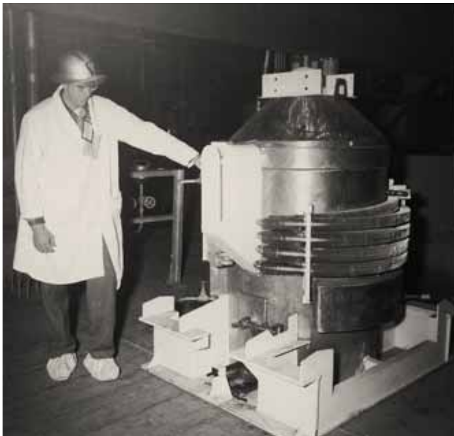
Shipping cask used to transport "green" MTR fuel elements. Note cooling coils.

Spent MTR fuel fresh out of the reactor would contain RaLa. Up to this time, AEC Headquarters had not considered harvesting RaLa from the MTR. The plan was just the opposite. Spent nuclear fuel from the MTR would sit