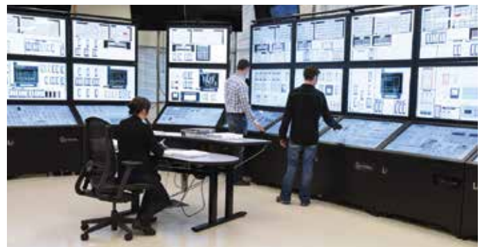
The Human Systems Simulation Laboratory at INL is a reconfigurable virtual control room used for operator training and research.

A U.S. Department of Energy National Laboratory