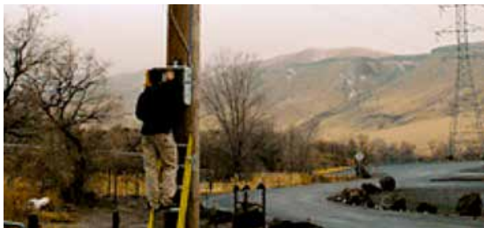
INL researchers and Idaho Power installed more than 40 weather stations along transmission lines in a windy part of southern Idaho's interstate utility corridor.

“stiff” — meaning its mathematical models are extremely challenging and time-consuming to solve. Furthermore, the current national standard (IEEE Std. 738) addresses neither the interactions between the inherent dynamics, nor how lines respond to perturbations.