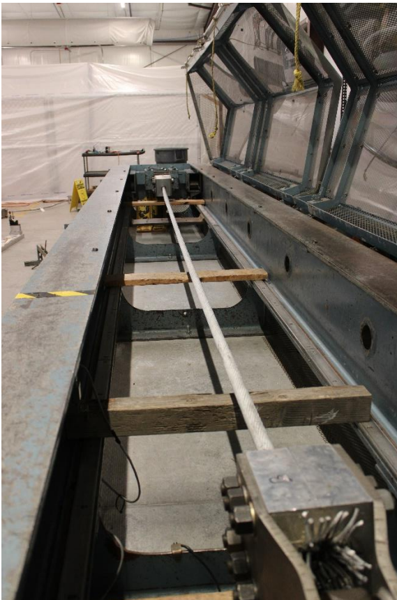
Figure 1: Conductor Sample

The two samples used for this test (complete conductor and core) were samples used in prior stress-strain testing for this project. The conductor sample had an approximate length of 19.5 ft while the core sample had a total length of approximately 21 ft.