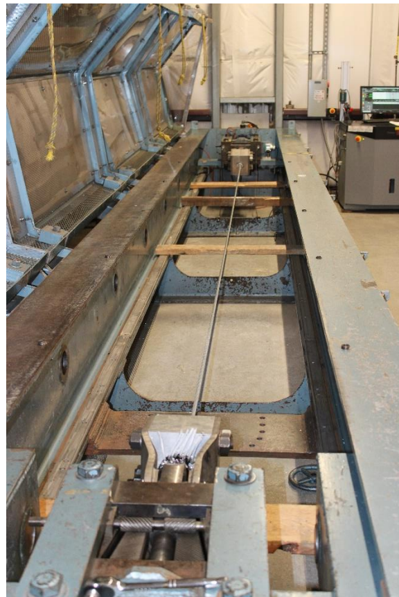
Figure 2: Core Sample